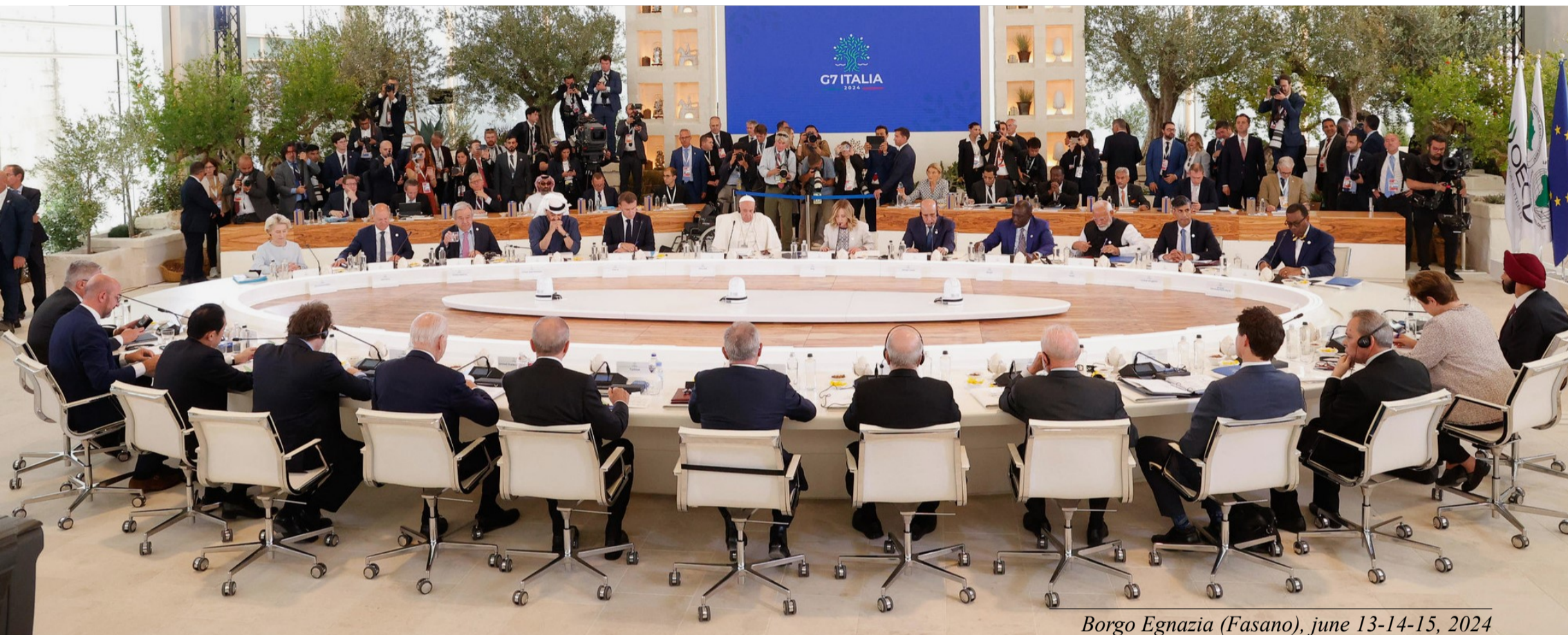
Borgo Egnazia (Fasano), june 13-14-15, 2024

Chronicle of the G7 held in Italy from 13 to 15 June 2024